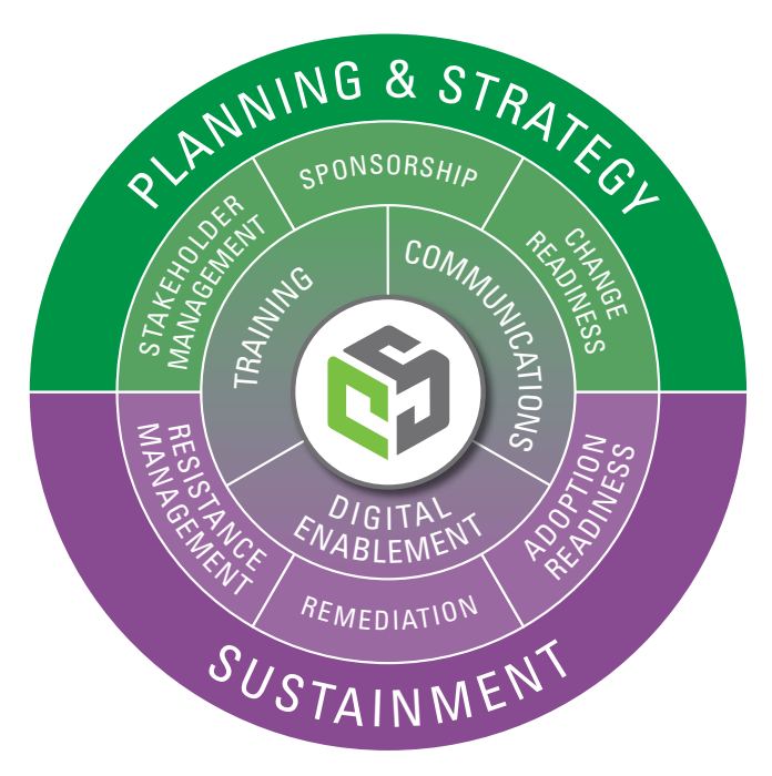
Organizational Change Management & Training Services

"One size fits all" is not in our vocabulary. Our flexible and responsive framework enables us to identify and tailor a range of appropriate services to address specific challenges at any stage of your transformation. Collaborative's Advisory Services customers trust us to lead and support them through strategic road mapping and governance planning, staged technology deployments, M&A activities, and continuous improvement cycles, as well as both ongoing and point-of-need staffing support.