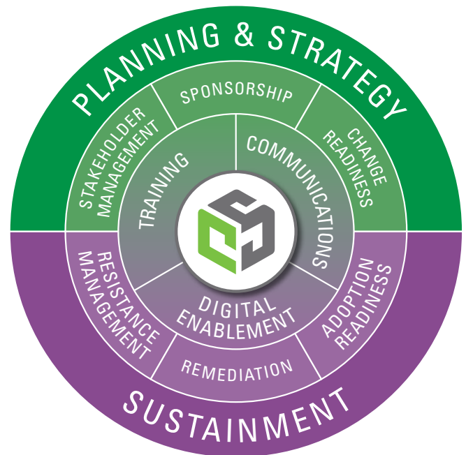
Organizational Change Management & Training Services

"One size fits all" is not in our vocabulary. Our flexible and responsive framework enables us to identify and tailor a range of appropriate services to address specific challenges at any stage of your transformation. Collaborative's Advisory Services customers trust us to lead and support them through strategic road mapping and governance planning, staged technology deployments, M&A activities, and continuous improvement cycles, as well as both ongoing and point-of-need staffing support.